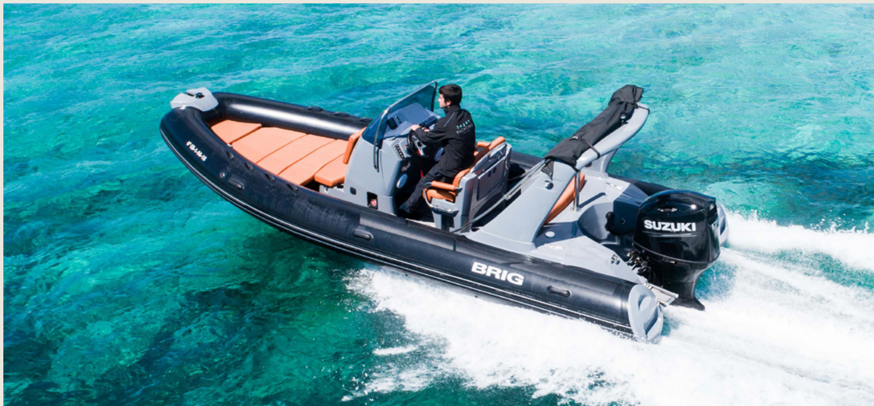
BRIG 650 SPEEDY GONZALEZ